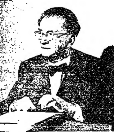
Dr. SIEGFRIED MOSES — was Israel's first State Comptroller, a post he held for 12 years, during which time he laid the foundations for one of the most important aspects of Israel's democracy. He served as the courageous President of the German Zionist Organization during the 1930s, and continued his leadership of the German group after settling in this country. Today he heads the Leo Baeck Institute.